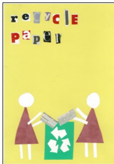
Craigroyston Primary School