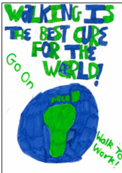
Lorne Primary School