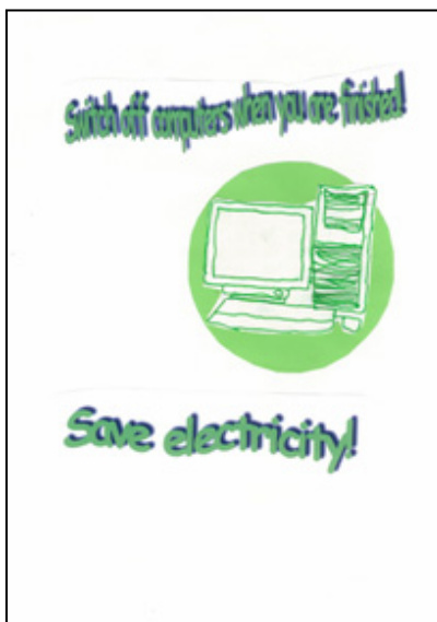
Prospect Bank Special School