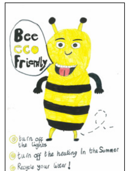
Fox Covert RC Primary School